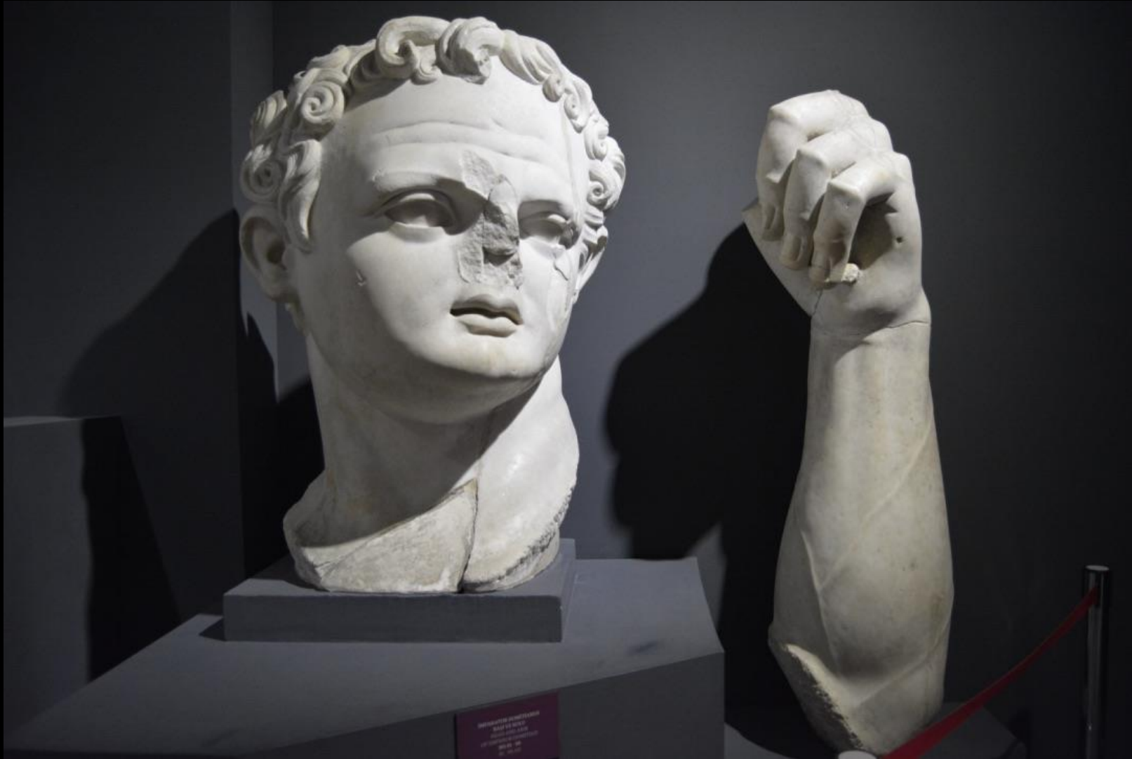
Marble bust of a young man, possibly a deity or philosopher, with curly hair and a damaged nose. The sculpture is displayed on a dark grey pedestal. To the right, a separate marble arm sculpture is visible, clenched in a fist. A red stanchion with a red rope is present in the lower right corner. A small red label with white text is attached to the front of the pedestal.