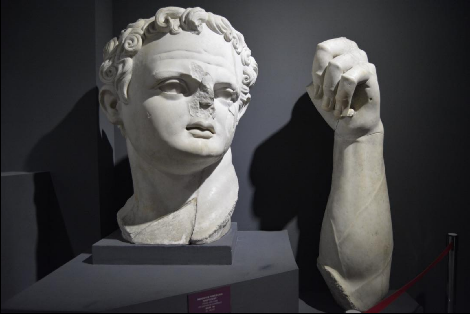
Marble bust of a young man, possibly a deity or philosopher, with curly hair and a damaged nose. The sculpture is displayed on a dark grey pedestal. A red stanchion with a red rope is visible in the lower right corner.