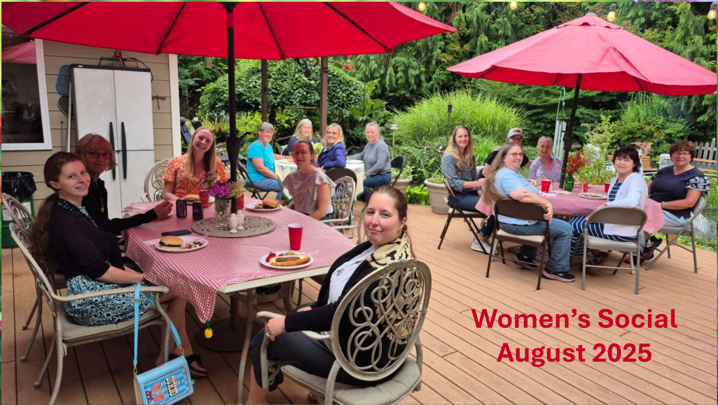
Women's Social August 2025