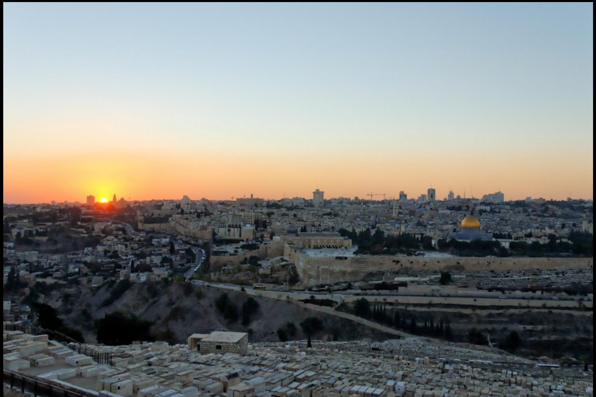
Sunset over Jerusalem from the Mount of Olives