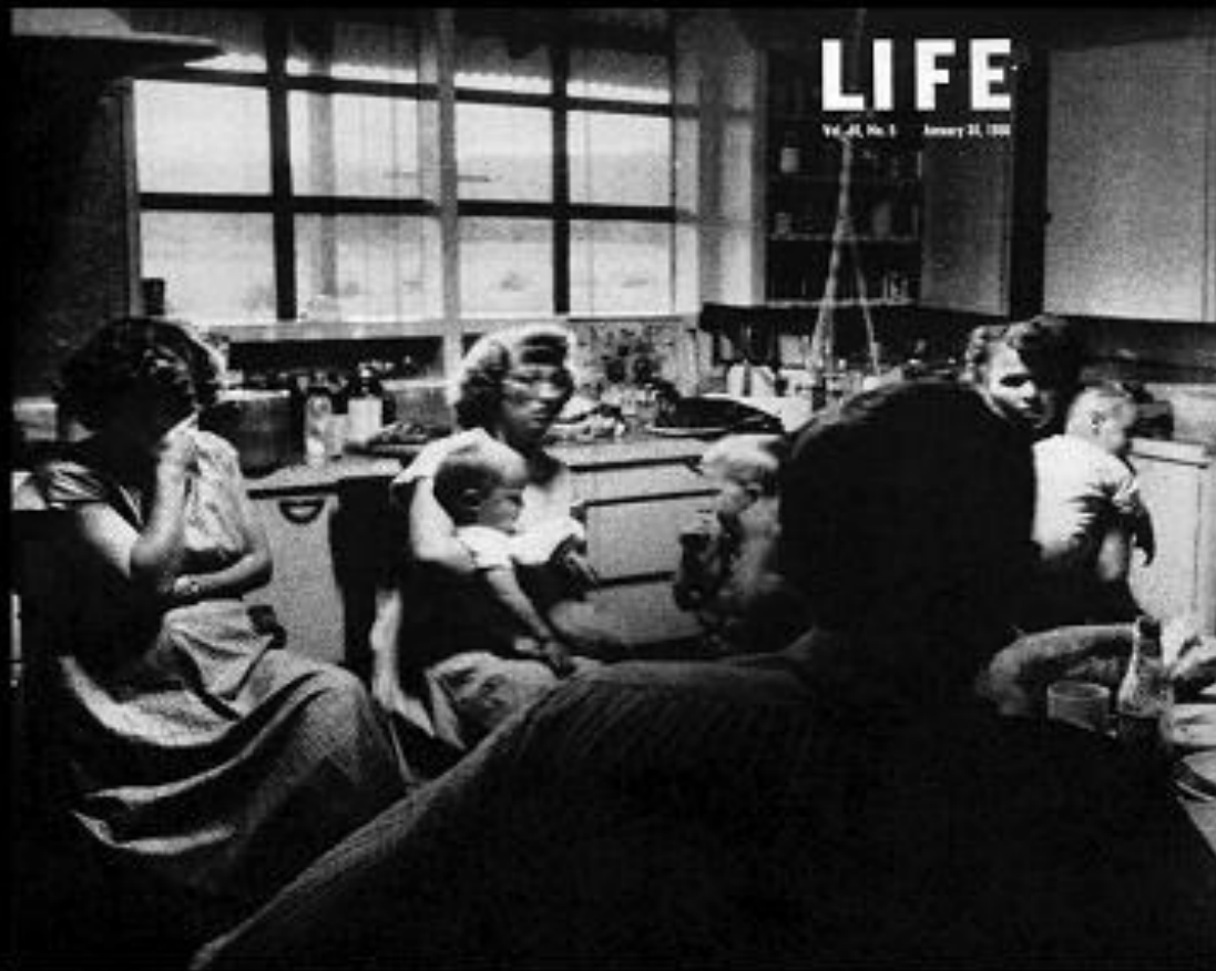
THE FIVE WIDOWS , who had been waiting at the Shell Station, Ecuador mission station for the agonizing process of discovery of their husbands' fates in the