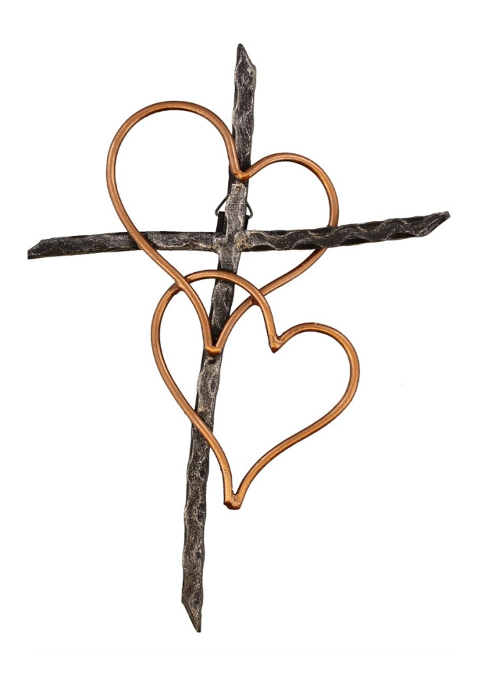
February 18, 2024