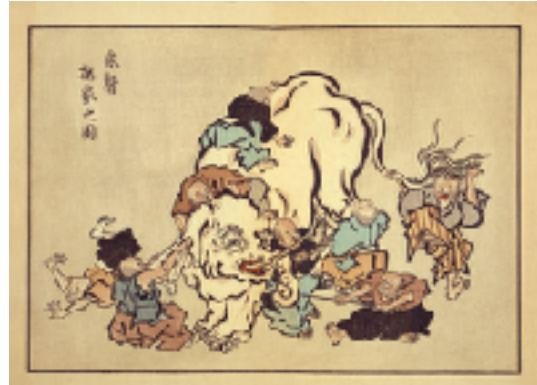
ILLUSTRATION: The Buddhist Elephant Parable is something most of us have heard of. It compare religion to a group of blind me who encounter an Elephant. Each takes hold of a different part of the Elephant. One take the trunk and say, “This animal is long and flexible”. Another takes the leg and says, “No this animal is stiff and solid”. Sill another the side and says, “This animal is broad and wide”. The point is, religion is the same way, every religion has some truth but all only have part.

CONSIDER however the Relativist, the story teller - it is he that is claim to be the one who can see all of these blind people. He is claiming to have an objective truth. If all truth is relative, he too is blind and has nothing to teach the others, you see.