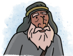
the servant •