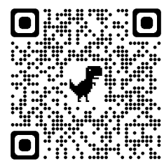
FASTING STARTER KIT