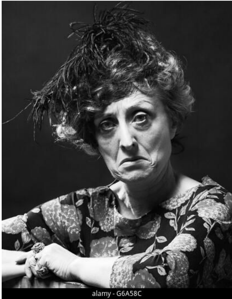
alamy - G6A58C