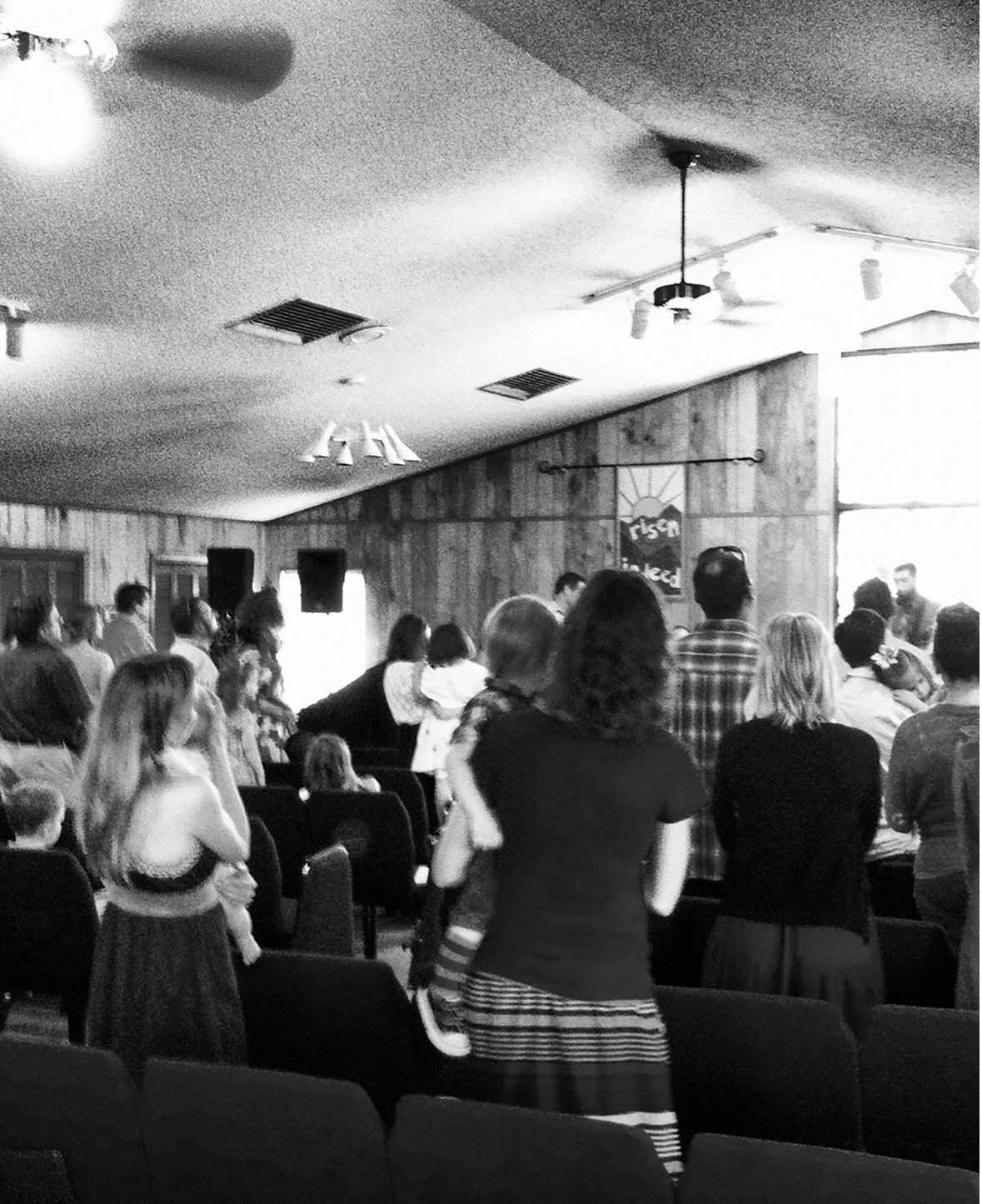
▲ Our first Easter Service in 2012 at Grace Lutheran Church, Sunday at 4pm