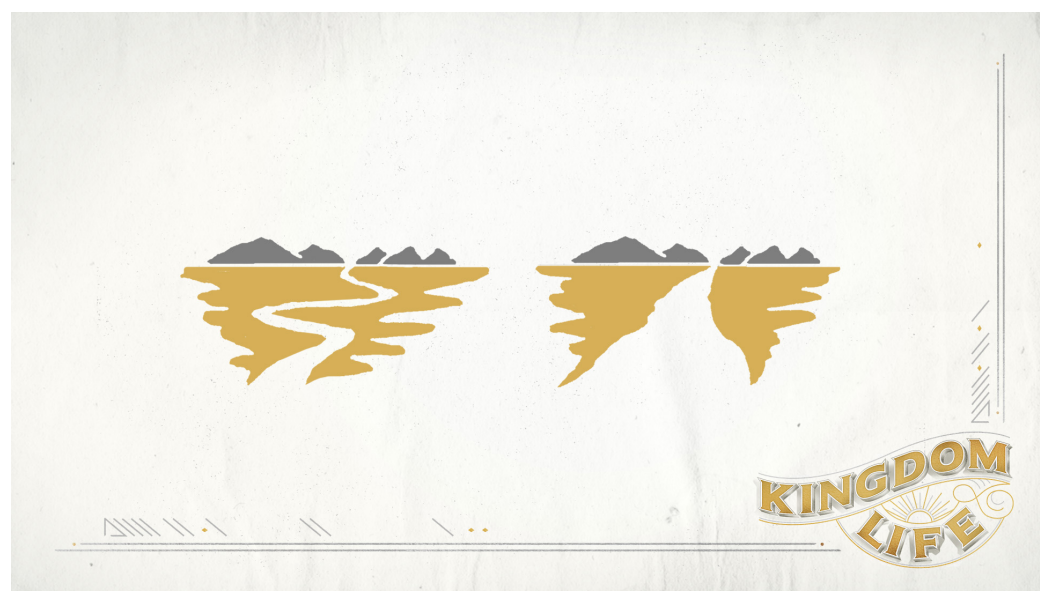
ONE PATH IS WIDE AND EASY; THE OTHER IS NARROW AND HARD.