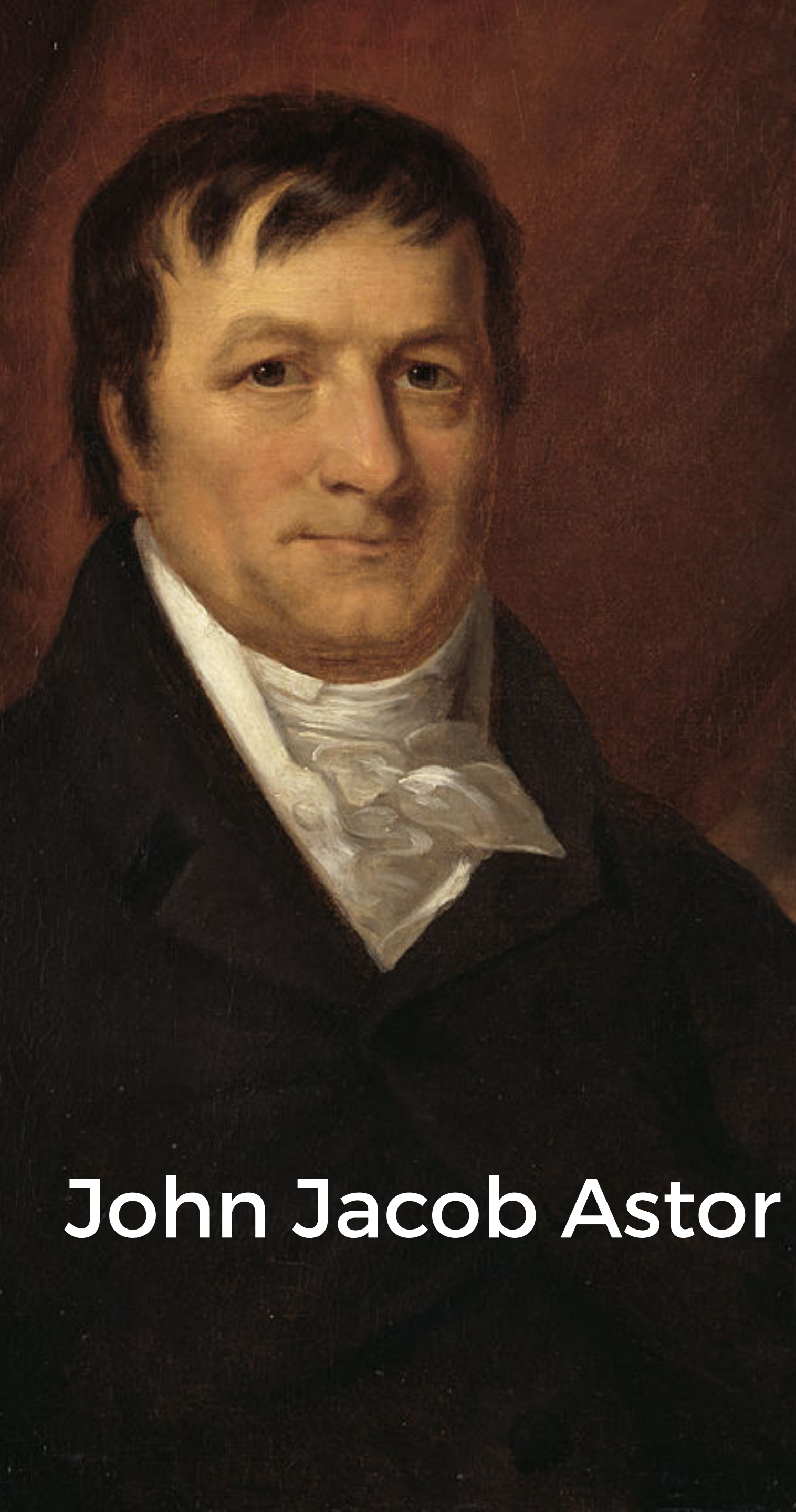
John Jacob Astor