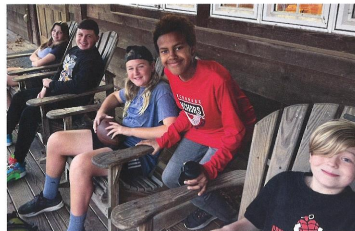
ANCHORAGE PRESBYTERIAN CHURCH

A tri-presbytery event, called "Belonging Together," brought together a diverse group of sixth to 12th graders across the Commonwealth of Kentucky. This event served to lift up the Matthew 25 vision "to demonstrate as people of God we have a true calling to address division, exclusion and all that goes against the love of Jesus Christ in our world."