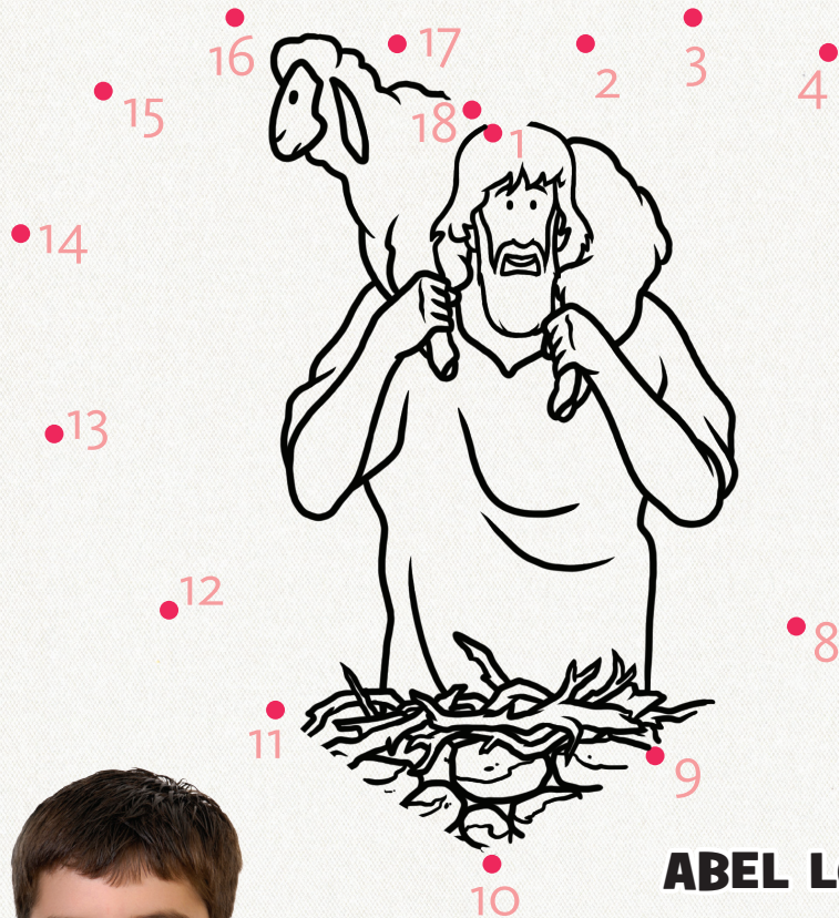
ABEL LOVED GOD

Start at A and draw a line to the next letter. Keep going in order until the picture is finished.