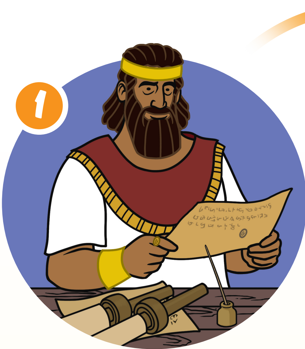
God caused King Cyrus to let the Jews go home.