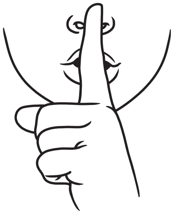
Be very quiet.