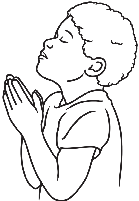
Close your eyes to pray.