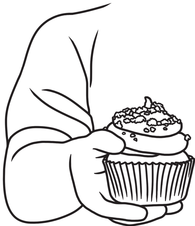
Give it to me.