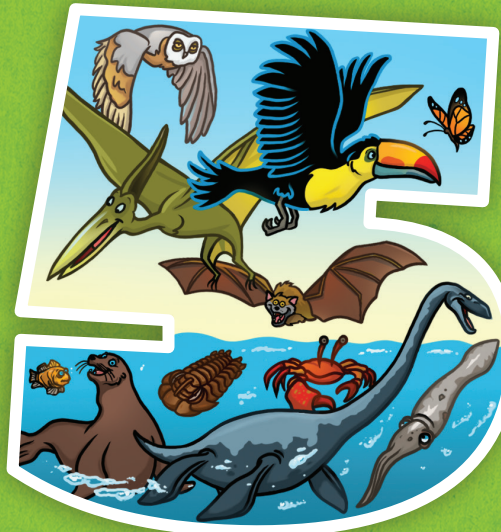
Sea Creatures and Flying Creatures