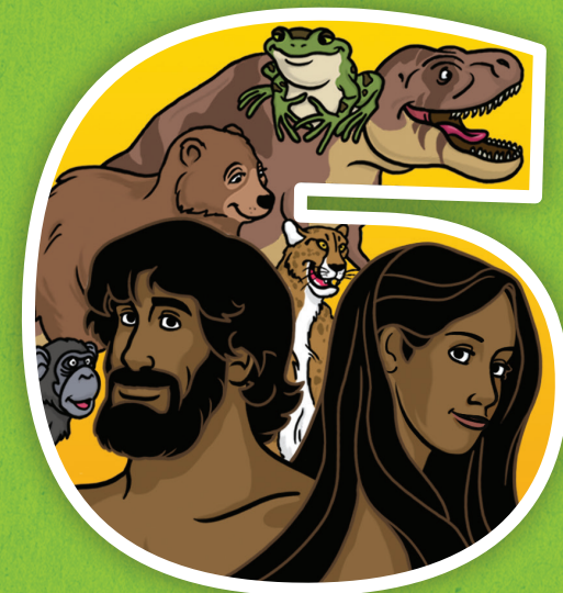
Land Animals and People