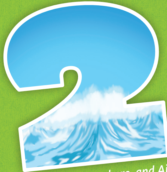
Expanse, Atmosphere, and Air