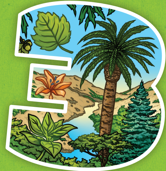
Dry Land and Plants