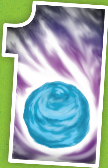
Heavens, Earth, and Light