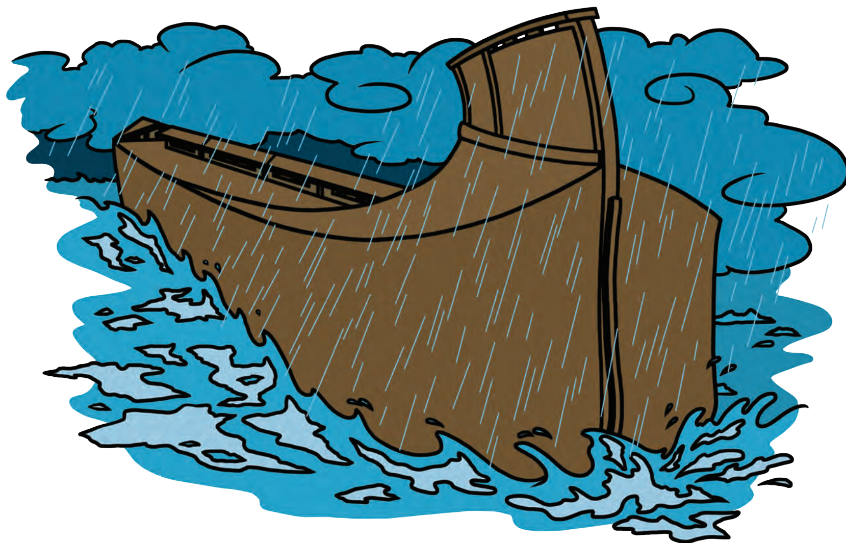
3 God sent the flood