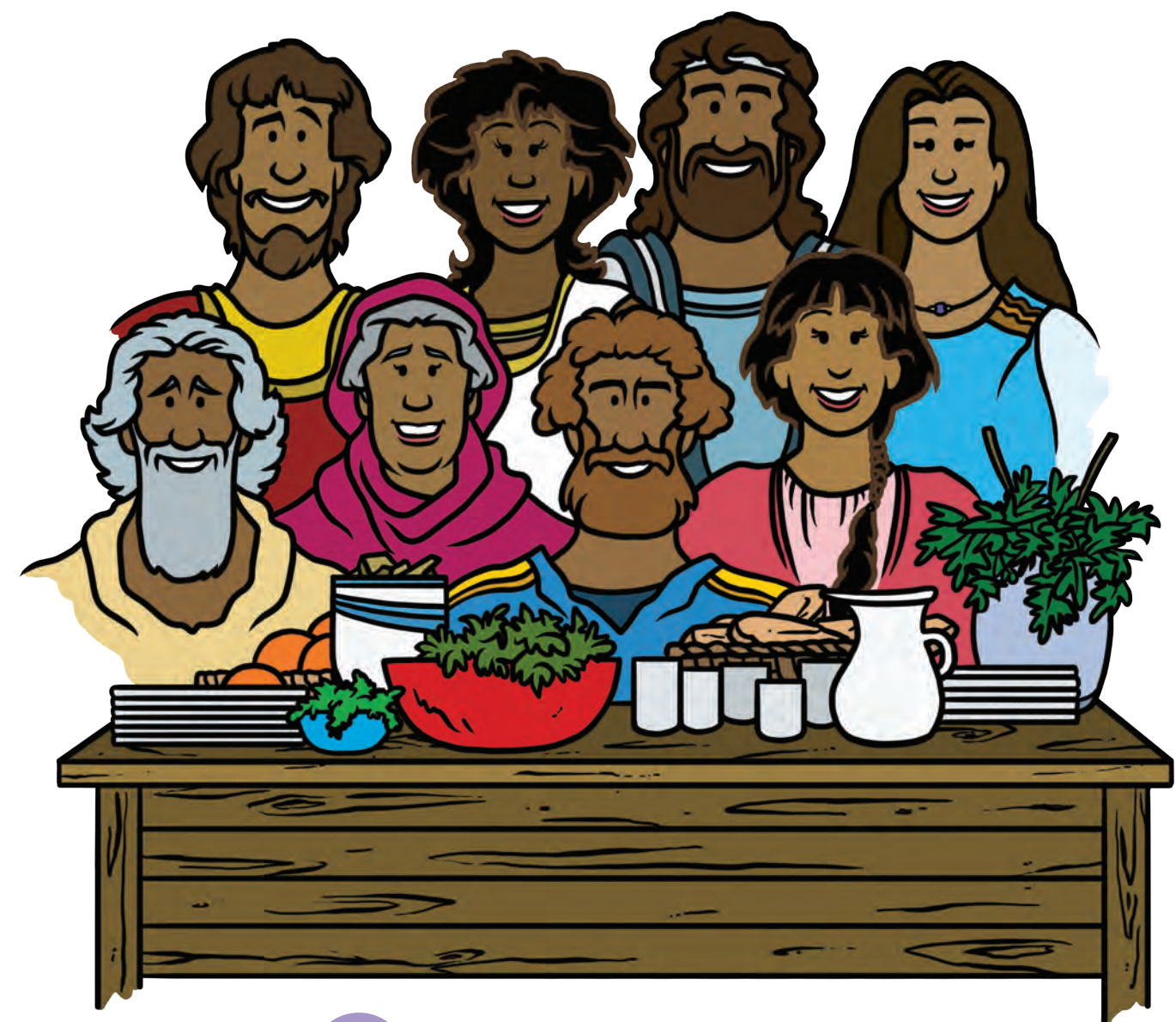
4 Safe in the ark