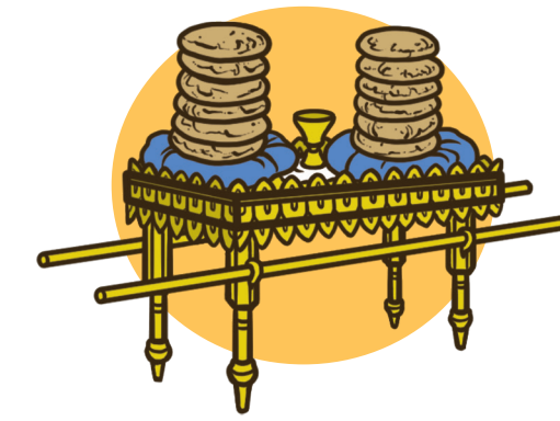
Table of Showbread