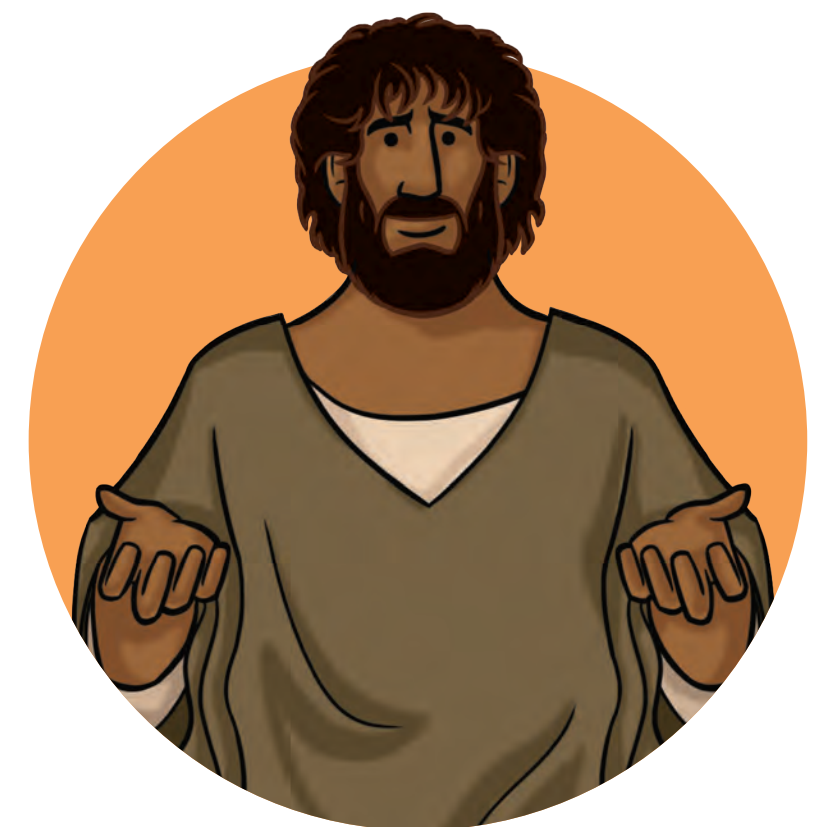
Jesus is the Son of God who saves those who believe.