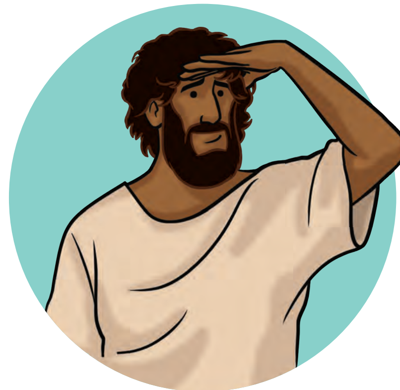
Jesus came to seek and save the lost.