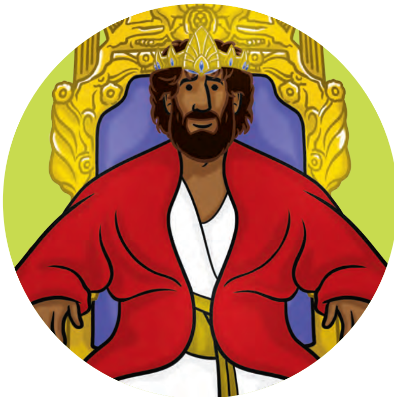
Jesus is the King!