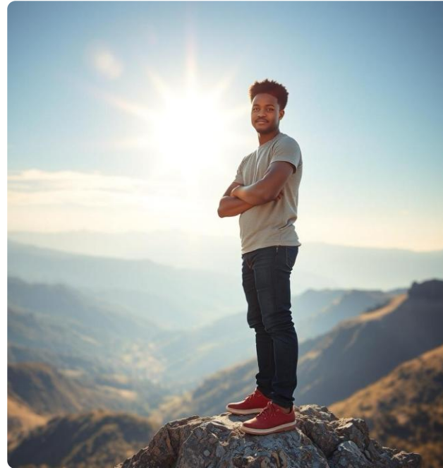
How to Stand Unshakable and with Purpose