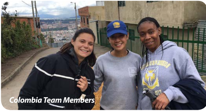
Colombia Team Members