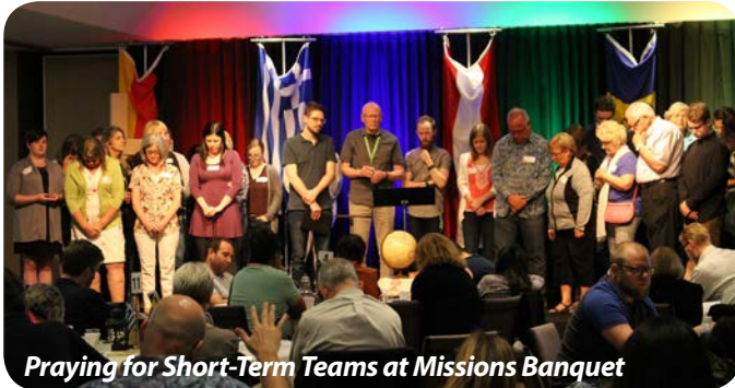
Praying for Short-Term Teams at Missions Banquet