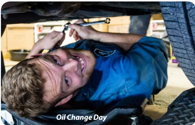
Oil Change Day