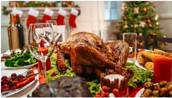
Faith in Christ forms fellowship in Christ.