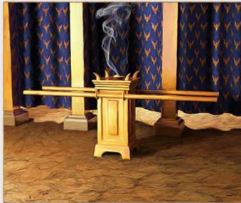
The Altar of Incense brings the prayers of God's people before Him.