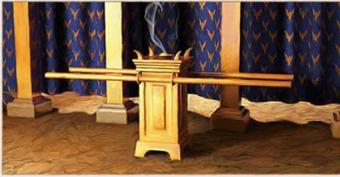
From Another Perspective Exodus 30.1-10