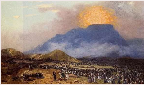
The law orients us toward God, and exposes our need for a savior.