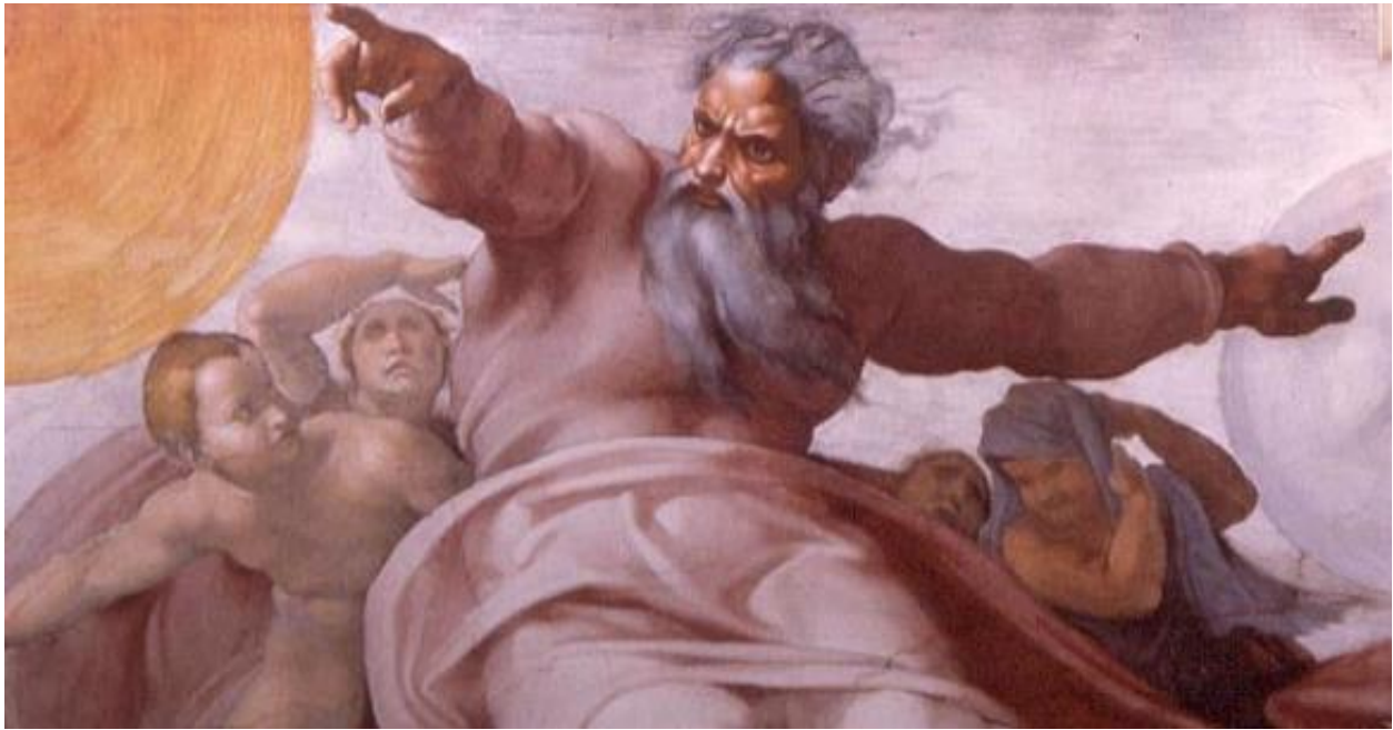
An Angry God?

12 Be careful to remember the Sabbath day, to keep it holy as the LORD your God has commanded you. 13 You are to labor six days and do all your work, 14 but the seventh day is a Sabbath to the LORD your God. Do not do any work—you, your son or daughter, your male or female slave, your ox or donkey, any of your livestock, or the resident alien who lives within your city gates, so that your male and female slaves may rest as you do. 15 Remember that you were a slave in the land of Egypt, and the LORD your God brought you out of there with a strong hand and an outstretched arm. That is why the LORD your God has commanded you to keep the Sabbath day. 16 Honor your father and your mother, as the LORD your God has commanded you, so that you may live long and so that you may prosper in the land the LORD your God is giving you. 17 Do not murder. 18 Do not commit adultery. 19 Do not steal. 20 Do not give dishonest testimony against your neighbor. 21 Do not covet your neighbor's wife or desire your neighbor's house, his field, his male or female slave, his ox or donkey, or anything that belongs to your neighbor.