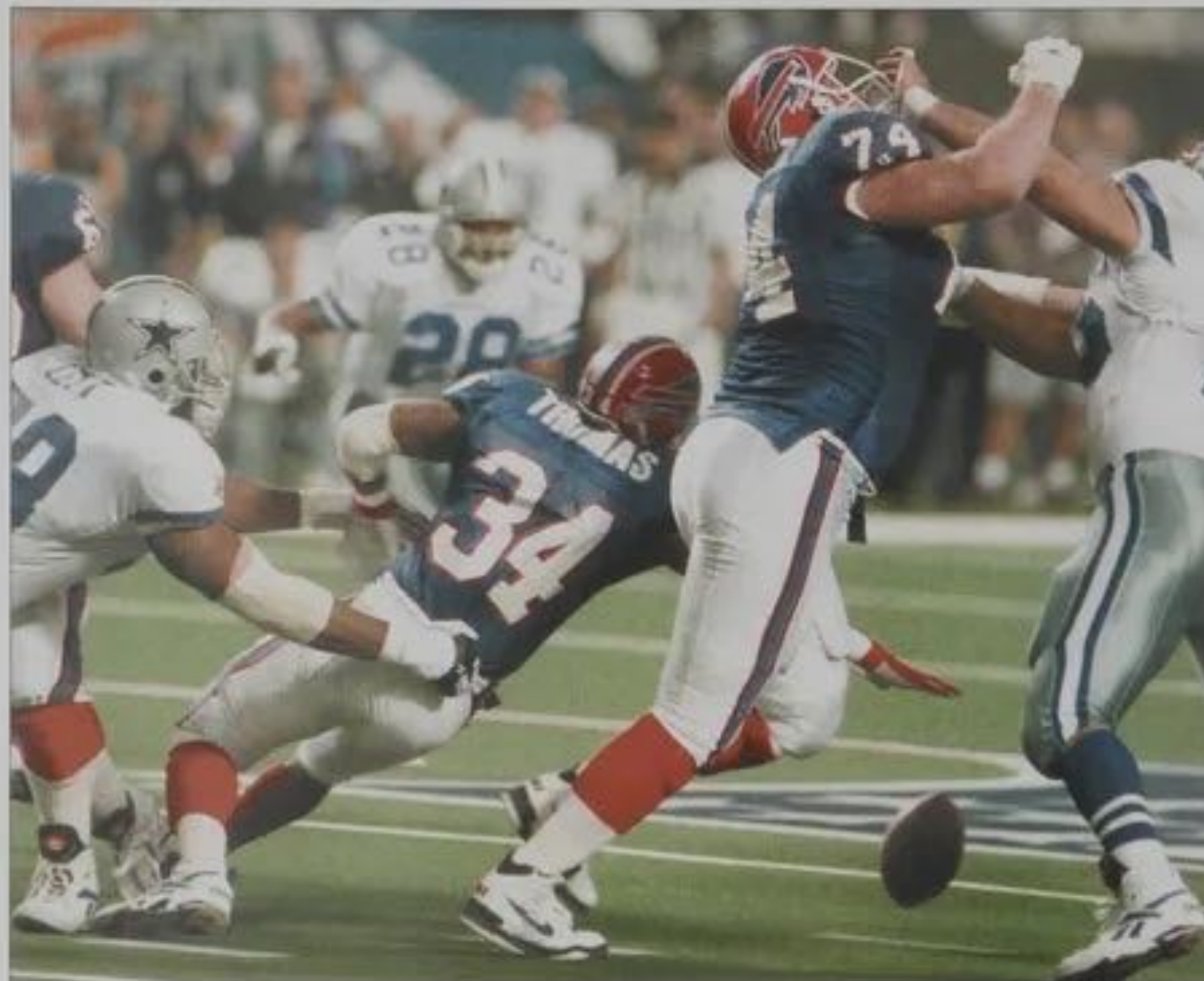
Thurman Thomas fumbles to open the third quarter, leading to a Cowboys touchdown.