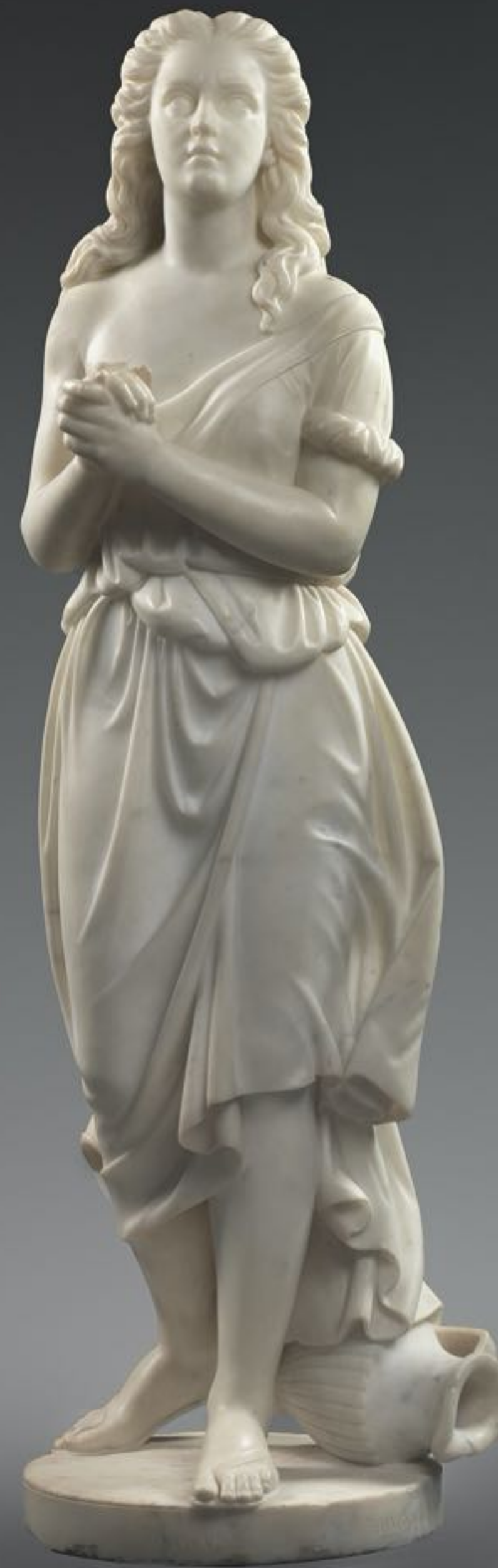
Edmonia Lewis sculpture of Hagar