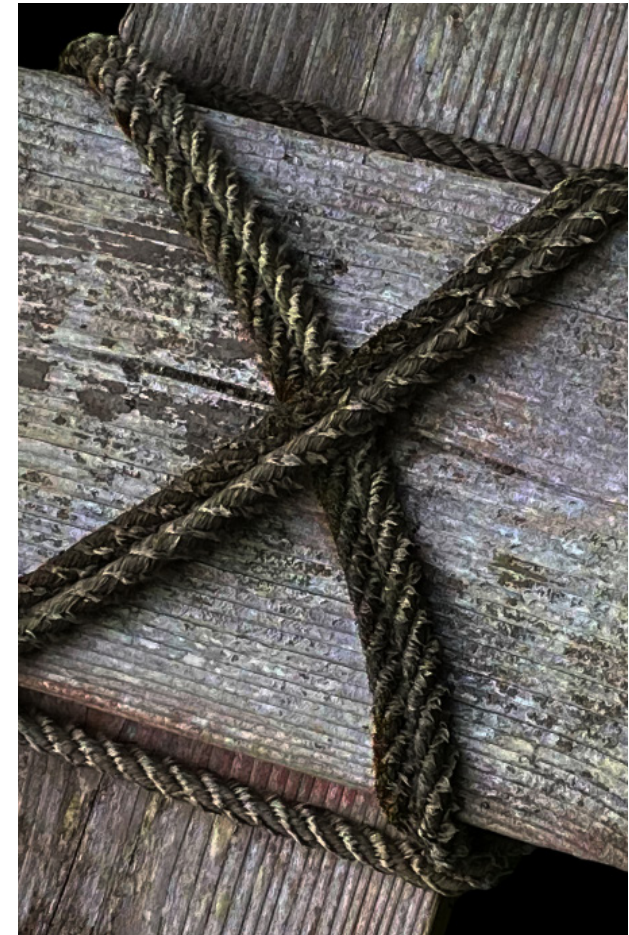
a narrated tour, retracing the steps of Jesus from the garden to the tomb