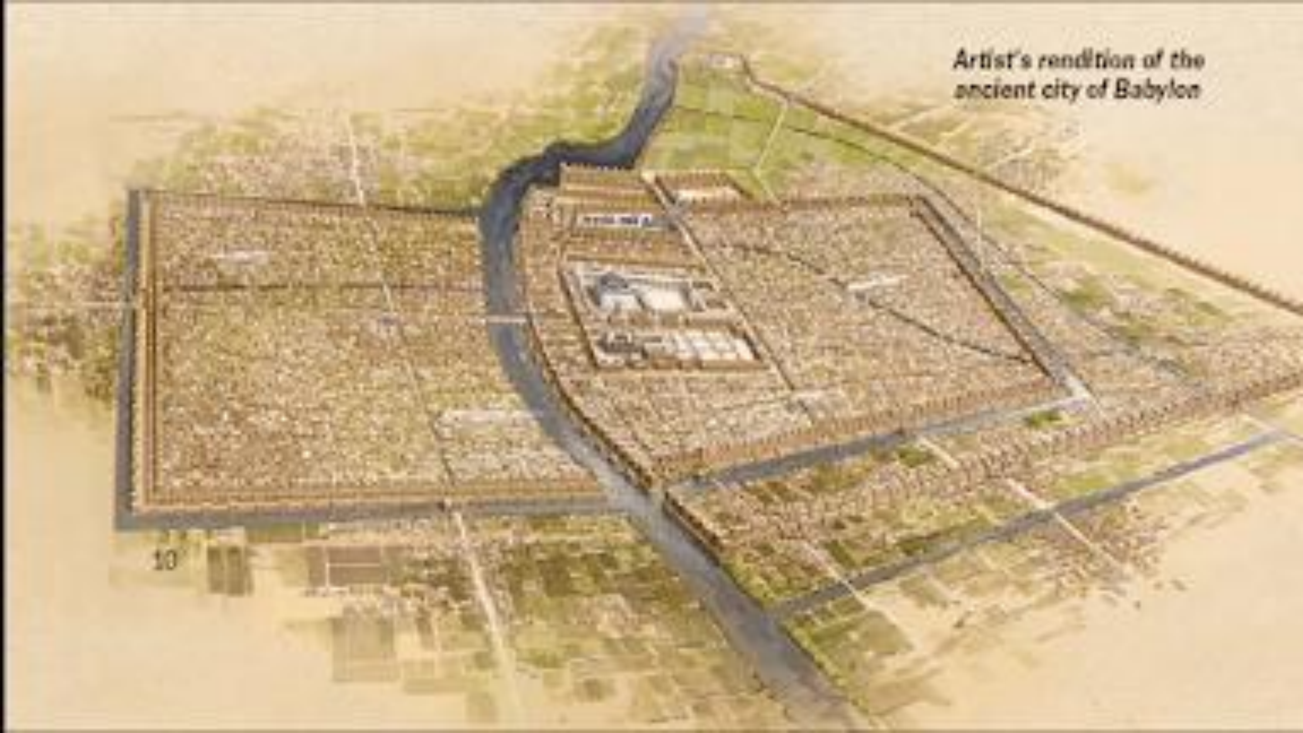
Artist's rendition of the ancient city of Babylon