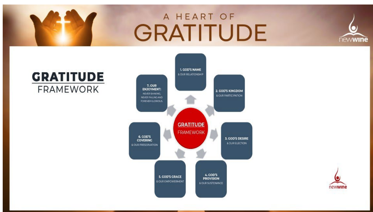
Diagram 2: Gratitude Framework

Expressing gratitude by employing the above framework radically changes our responses to the effects of the VUCA world.