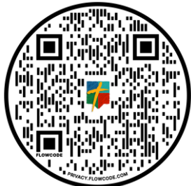
Connect/Prayer Request Card

*Please fill out the CONNECT/PRAAYER REQUESTS card! We’d love to have a record of your attendance & to help serve you on this journey to know God more! You may also GIVE ONLINE!