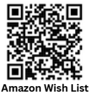
Amazon Wish List

Donation Station: For the month of March we are collecting Shoes. Follow the QR code to purchase from Amazon and have delivered to our church. You can also purchase and bring your donation to church.