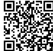
St. John's on the Lake