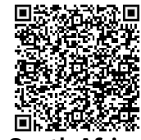
South Africa Adopt-A-Bed

Hillcrest AIDS Centre has an "Adopt a Bed" program. Our team is hoping to raise funds to adopt one bed for a year. The cost of a bed is $5500. This provides meds and foods and nursing staff for a patient for one year.