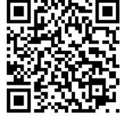
St. John's on the Lake