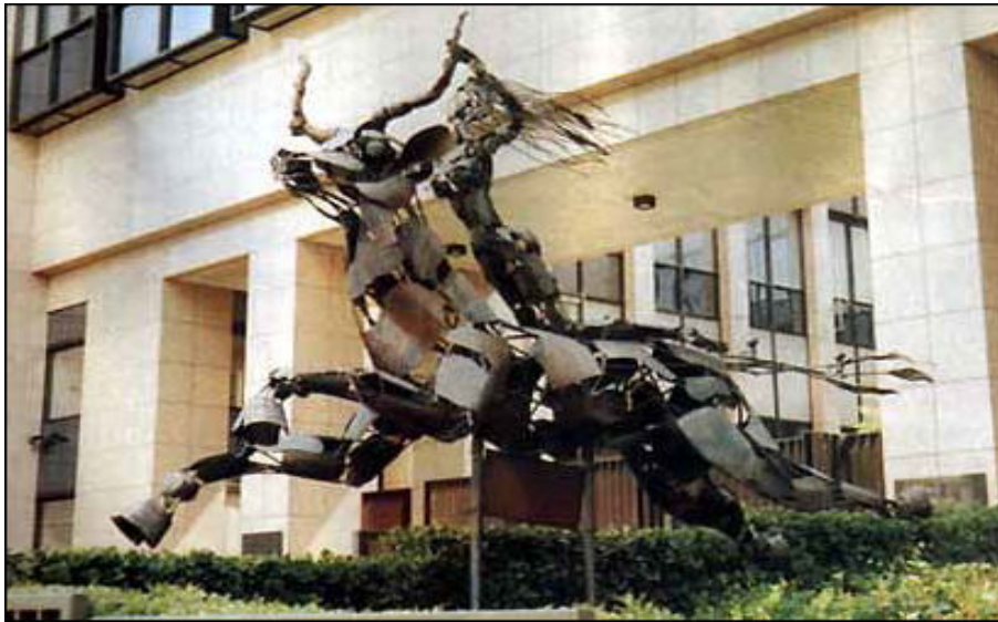
This statue is located outside EU headquarters in Brussels, Belgium.