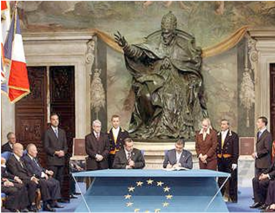
> CAPITAL HILL, ROME, OCTOBER 29, 2004 - SIGNING OF THE E.U. AGREEMENT UNDER A STATUE OF POPE INNOCENT X.

- David Rockefeller in his memoirs said, “Some even believe we are part of a secret cabal working against the best interests of the United States, characterizing my family and me as ‘internationalists’ and of conspiring with others around the world to build a more integrated global political and economic structure—one world, if you will. If that’s the charge, I stand guilty, and I am proud of it.” (David Rockefeller, Memoirs , p. 405)