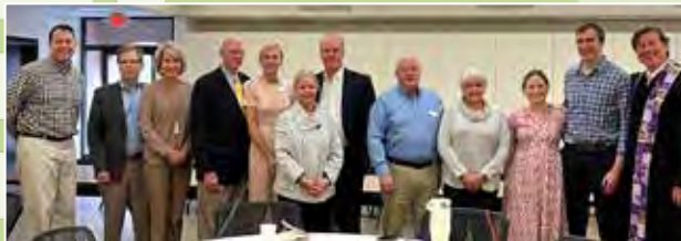
Sunday Morning Group