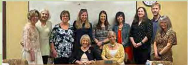
Donuts and Devotionals