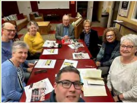
Monday Evening Group