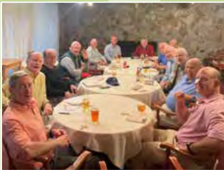
Theology on Tap