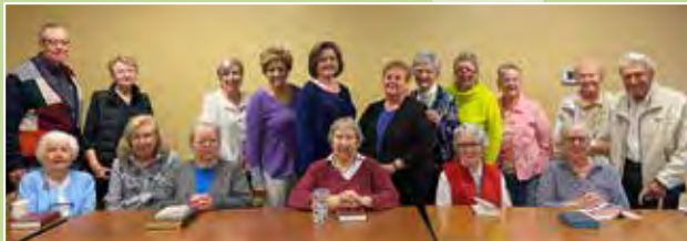
Thursday Afternoon Group