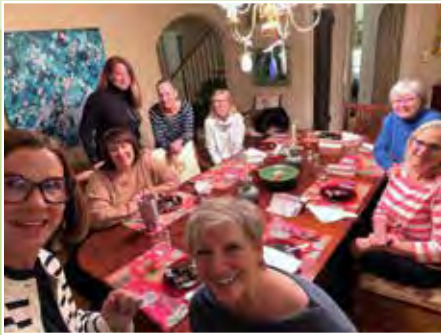
Sisters in Faith