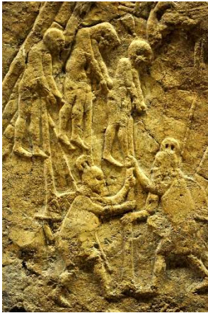
Assyrian relief of Israelite captives from Lachish being impaled during the siege.