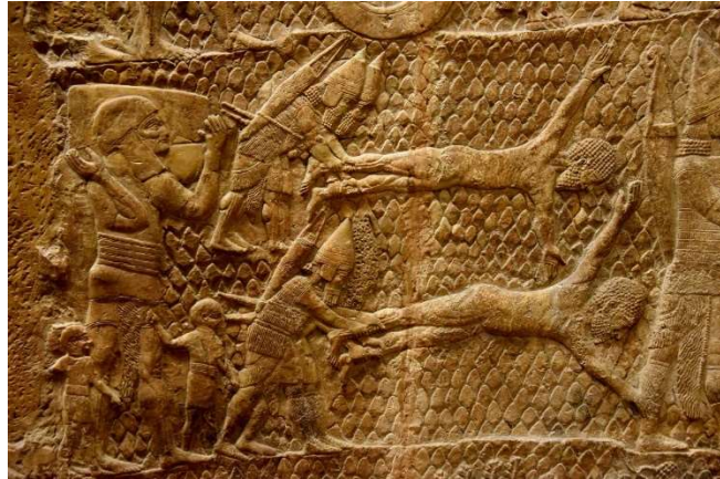
Assyrian relief of Israelite captives after the conquest being flayed alive in front of other captives.