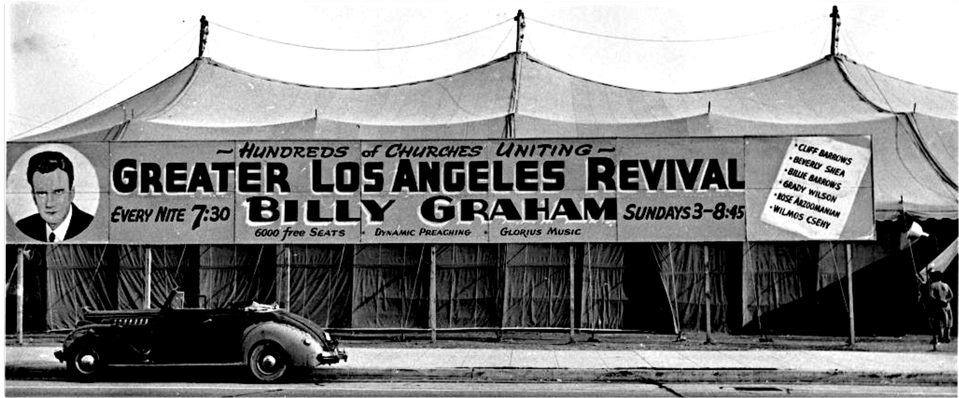
Billy Graham Tent Meetings 1948