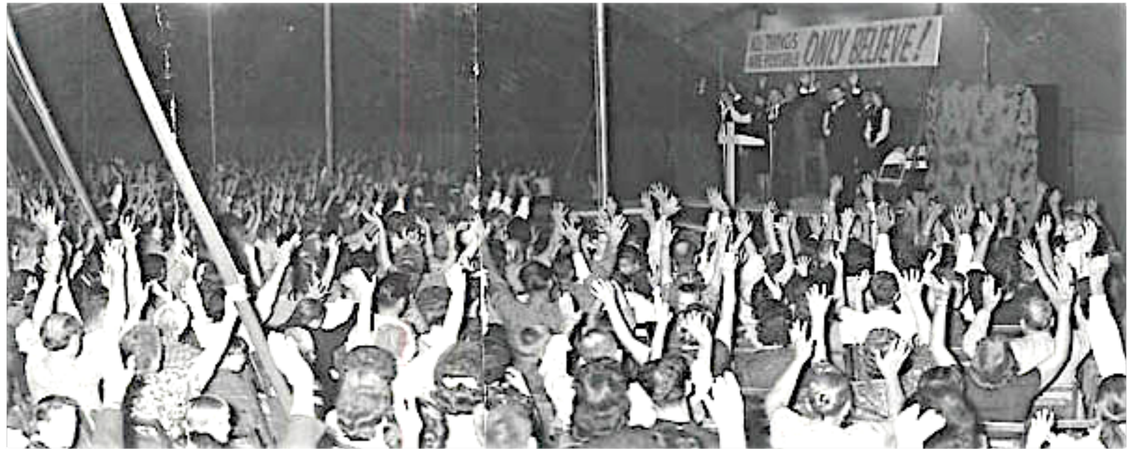
Azusa Street Tent Meetings early 1900s