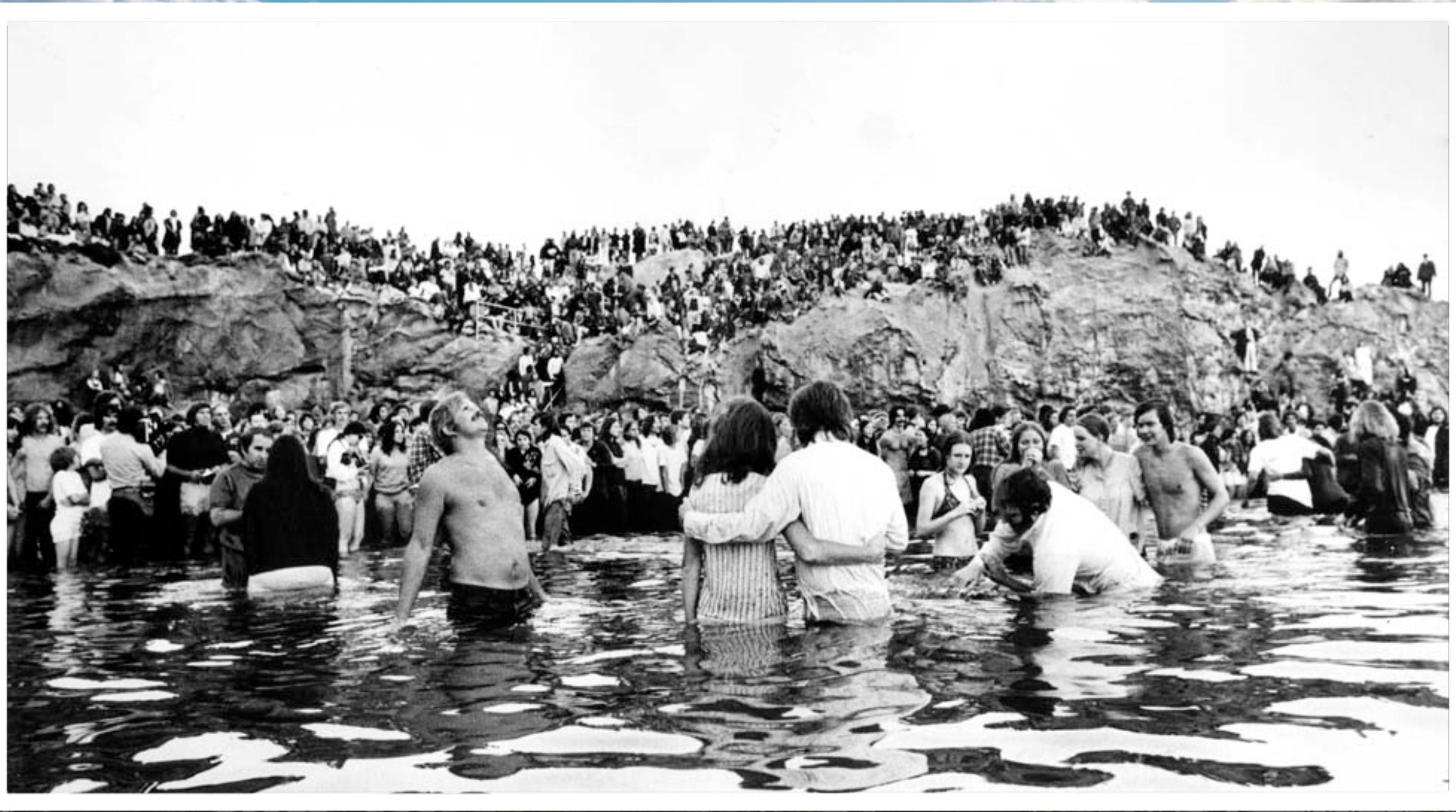
Jesus People Baptisms - Newport Beach early 1970s