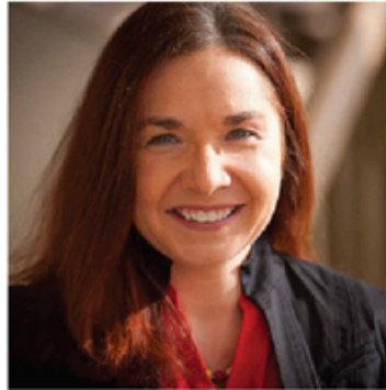
Katharine Hayhoe Atmospheric Scientist