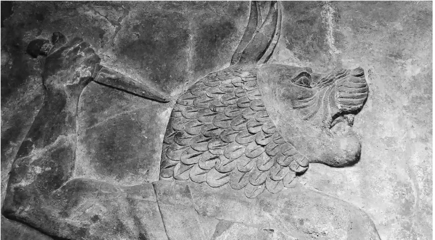
HERE'S AN ANCIENT ASSYRIAN INSCRIPTION WITH SUCH A SWORD.

17 And he presented the tribute to Eglon king of Moab. Now Eglon was a very fat man. 18 And when Ehud had finished presenting the tribute, he sent away the people who carried the tribute. 19 But he himself turned back at the idols near Gilgal and said, "I have a secret message for you, O king." And he commanded, "Silence." And all his attendants went out from his presence.