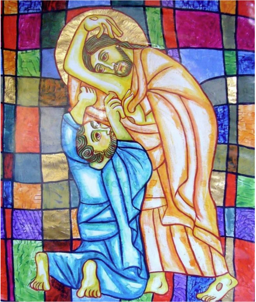
'Doubting Thomas' Stained Glass by Artist Unknown

WORSHIP SERVICE 2 ND SUNDAY OF EASTER 10:30 AM APRIL 16, 2023 614 Griffis Street, Cary, NC 27511 (919) 467-8700 www.carypresbyterian.org