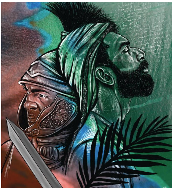
Power Play by Lisle Gwynn Garrity

Blessed is the one who comes in the name of the Lord.