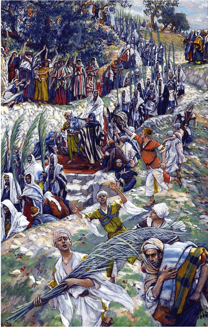
Triumphal Entry into Jerusalem by James Tissot