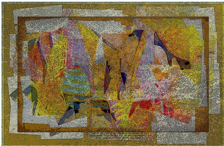
Psalm 111 Verse 10 by Mindy Newman