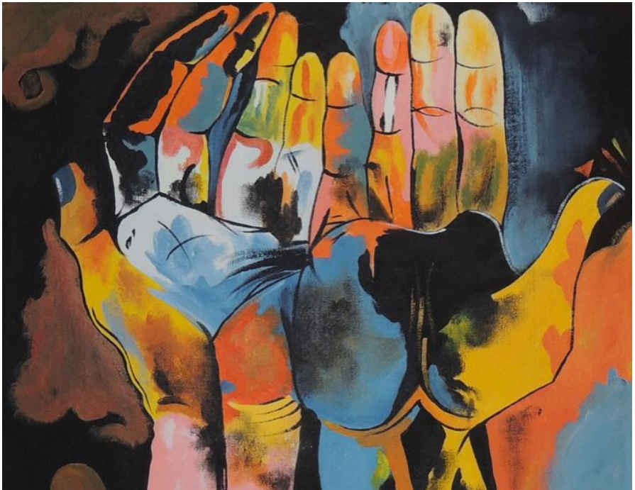
Manos insaciables by Oswaldo Guayasamin