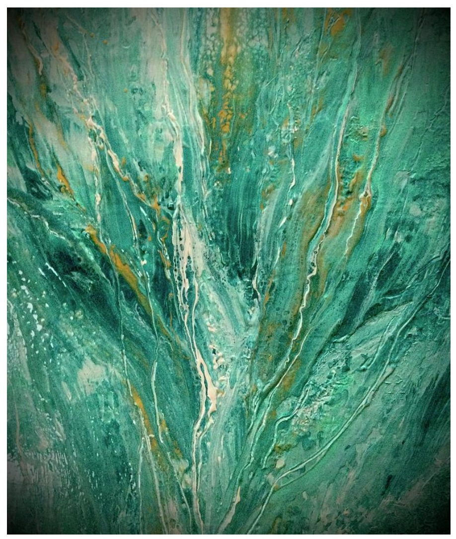
Streams of Living Waters by Judy Osiowy

WORSHIP SERVICE BLESSING OF THE BACKPACKS 12<sup>TH</sup> SUNDAY AFTER PENTECOST AUGUST 28, 2022 614 Griffis Street, Cary, NC 27511 (919) 467-8700 www.carypresbyterian.org