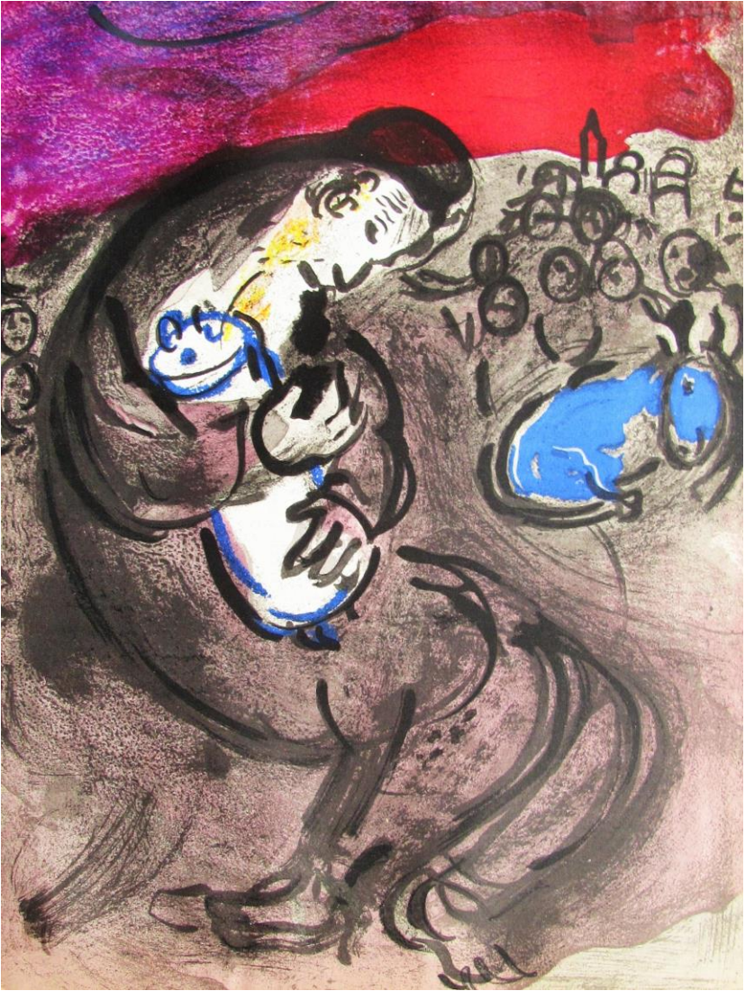
Jeremiah's Lamentations by Marc Chagall

WORSHIP SERVICE 15 TH SUNDAY AFTER PENTECOST SEPTEMBER 18, 2022 614 Griffis Street, Cary, NC 27511 (919) 467-8700 www.carypresbyterian.org