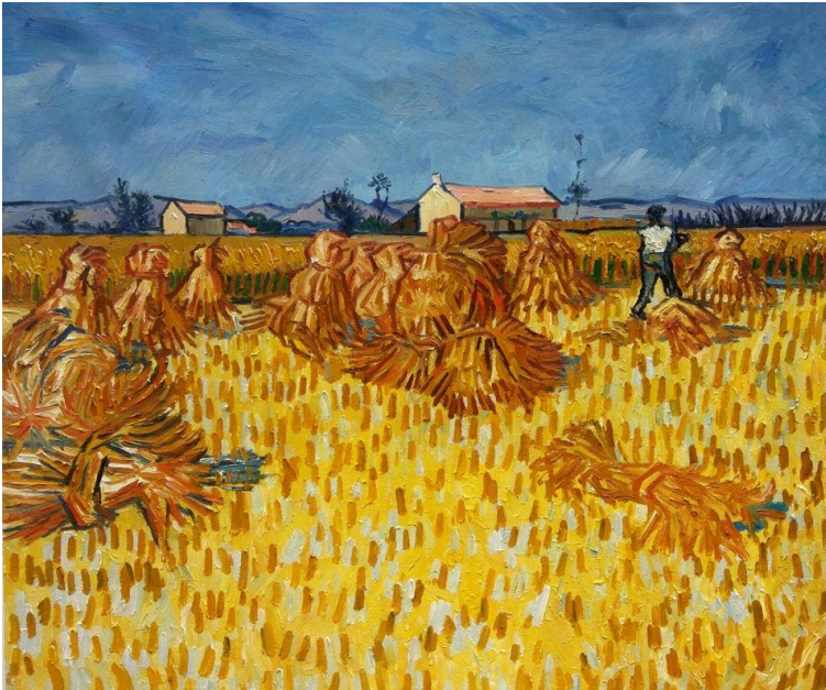
Harvest in Provence by Vincent Van Gogh

Help us, O God of our salvation, for the glory of your name; deliver us, and forgive our sins, for your name's sake. Come, let us worship God.