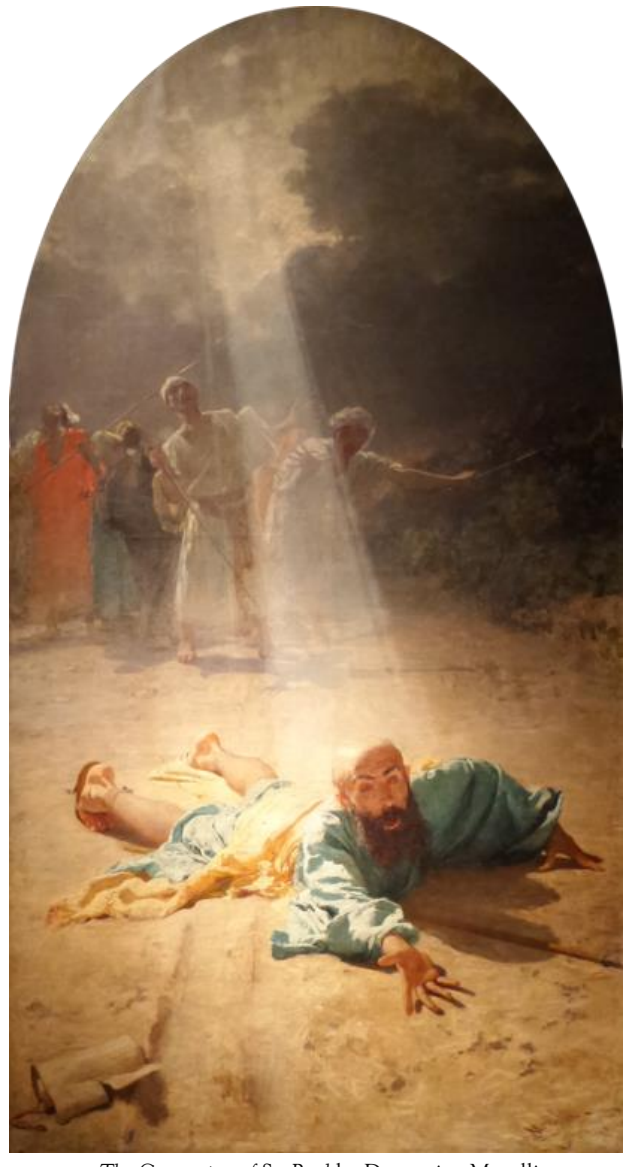
The Conversion of St. Paul by Domenico Morelli