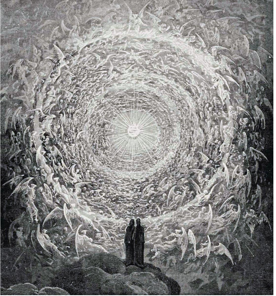
The White Rose by Gustav Doré from Dante's Paradiso