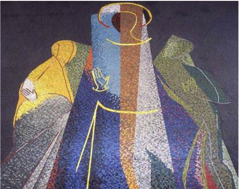
The Risen Christ at Emmaus (Mosaic) by John Piper