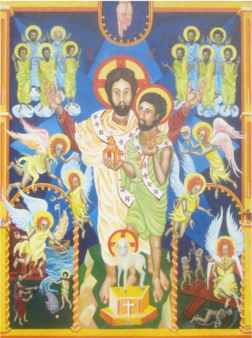
The Confession of St. Peter by Alexei Pismenny

WORSHIP SERVICE 14 TH SUNDAY AFTER PENTECOST SEPTEMBER 3, 2023 614 Griffis Street, Cary, NC 27511 (919) 467-8700 www.carypresbyterian.org