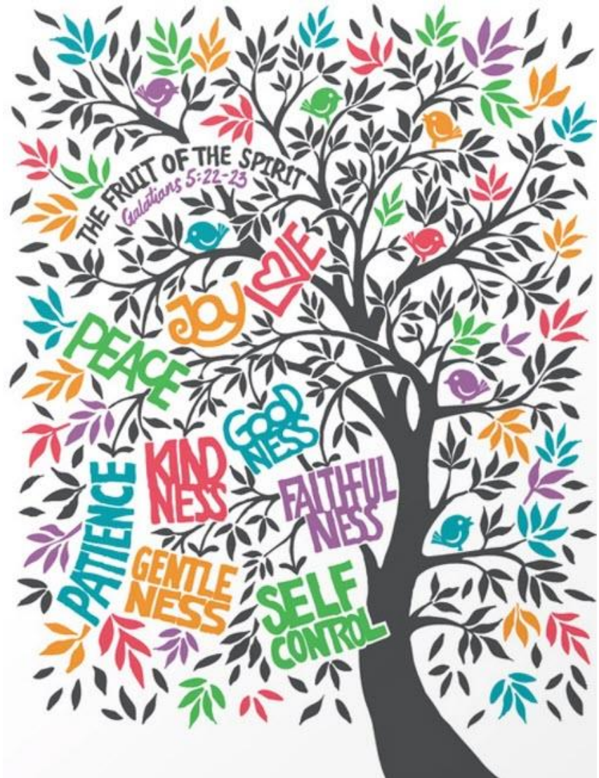
Fruit of the Spirit by Artist Unknown